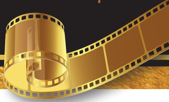
Table Sponsor – $10,500