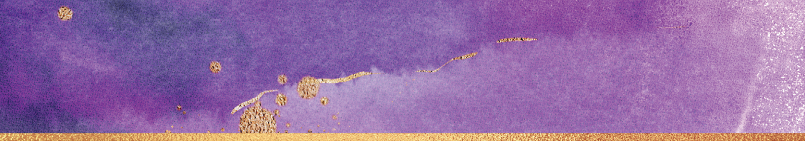
Table Sponsor – $5,500